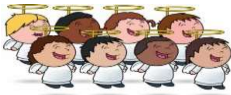
Joyful Noise Choir

The Men's Bible Study meets in the Funk Center at 8:00 AM each month on the first and third Sundays. We meet on May 7 & 21. We always have room around the table for a few more men. Join us as we gather over pastries and coffee to discuss the selected scripture passages.